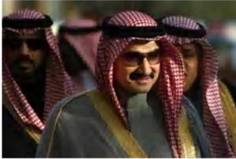
Pictured: Saudi Prince Al-Walid bin Talah

Over 49 separate law suits have been filed on the eligibility/birth certificate issue alone, with several of the suits making it all the way the United States Supreme Court, only to be denied a full hearing.