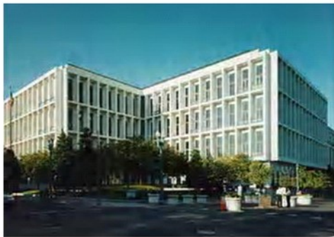
713 Hart Senate Office Building

There are no addresses listed in New York where he attended Columbia University, but there is one listed for him in nearby Jackson, NJ, with a Social Security number beginning with 485.